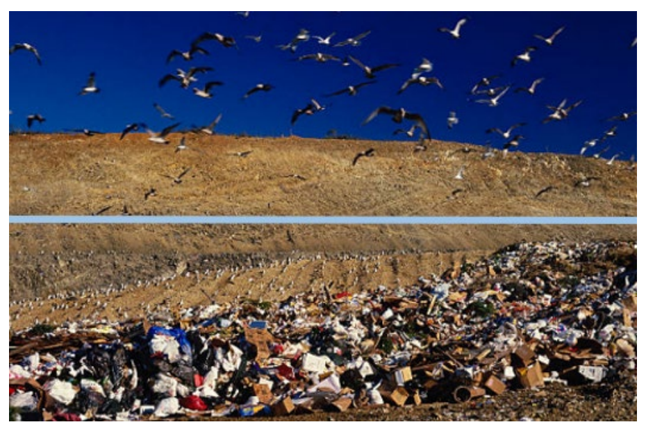
The blue highlighted line indicates where an active manufactured zeolite layer could function to intercept and destroy methane emitted from the underlying refuse

Methane is the second most significant GHG with a 100-year global warming potential 28 times greater than CO_2 and landfill methane releases just under 1 Gt of atmospheric CO_2 - e per annum.