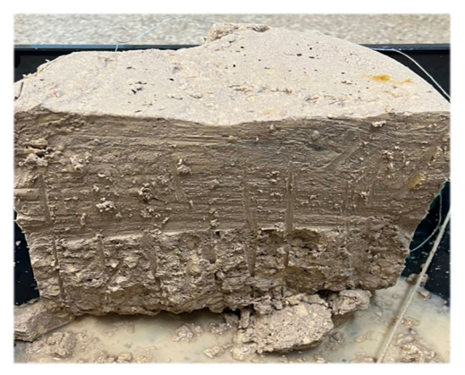
Lithium process by-product.

The Trailblazer program is scheduled to commence in the Q4 CY2022, with stage 1 targeting further process optimisation and de-risking, demonstration plant design, and pre-feasibility study.