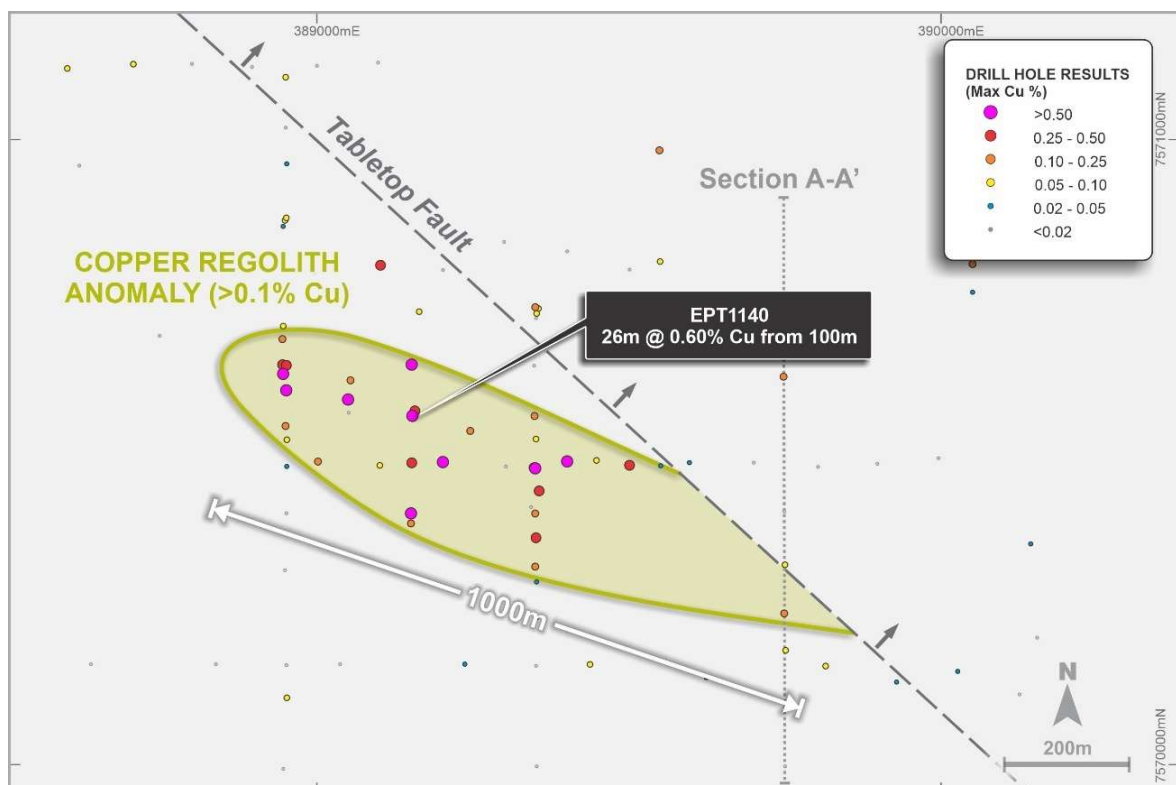
Figure 3 - Millennium drill hole location plan (max in hole Cu)

There was no field work carried out on this project during the quarter.