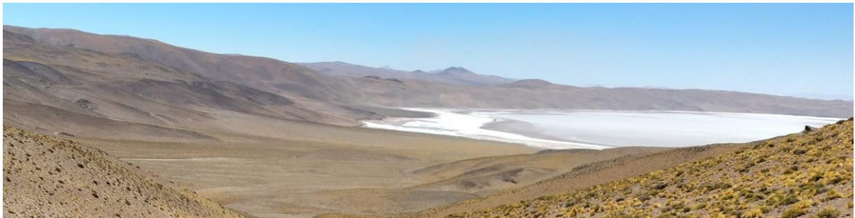
HMW Project looking north from Pata Pila

Greenbushes South Lithium Project: Galan has an Exploration Licence application (E70/4629) covering a total area of approximately 43 km 2 . It is approximately 15kms to the south of the Greenbushes mine. In January 2021, Galan entered into a sale and joint venture with Lithium Australia NL for an 80% interest in the Greenbushes South Lithium project, which is located 200 km south of Perth, the capital of Western Australia. With an area of 353 km 2 , the project was originally acquired by Lithium Australia NL due to its proximity to the Greenbushes Lithium Mine ('Greenbushes'), given that the project covers the southern strike projection of the geological structure that hosts Greenbushes. The project area commences about 3km south of the current Greenbushes open pit mining operations.