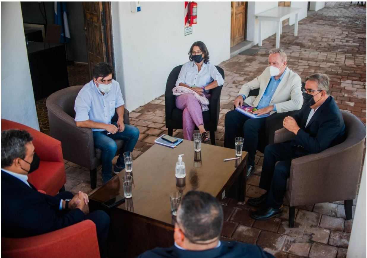
Figure 5 – Galan Managing Director and Exploration Manager meet with Governor Raúl Jalil, Vice Governor Rubén Dusso, Senator Lucía Corpacci and Mines Minister Marcelo Murua

This BMR profile strengthens the hydrogeological conceptual model and allows Galan to better recognise units for the construction of productive wells in the considered Mineral Resource area. These profile results continue to support SRK's Mineral Resource estimate models.