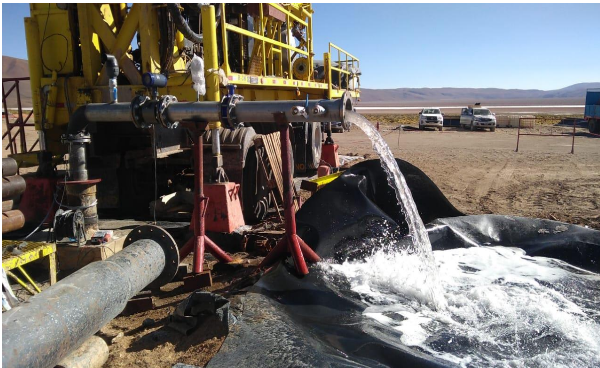
Figure 1 – Brine from pumping well PBPP-1-21 located at Pata Pila

Short-term pumping tests were successfully performed on both wells (see Figure 1). Long term hydraulic pumping tests are set to commence in May 2022, once monitoring wells are constructed.