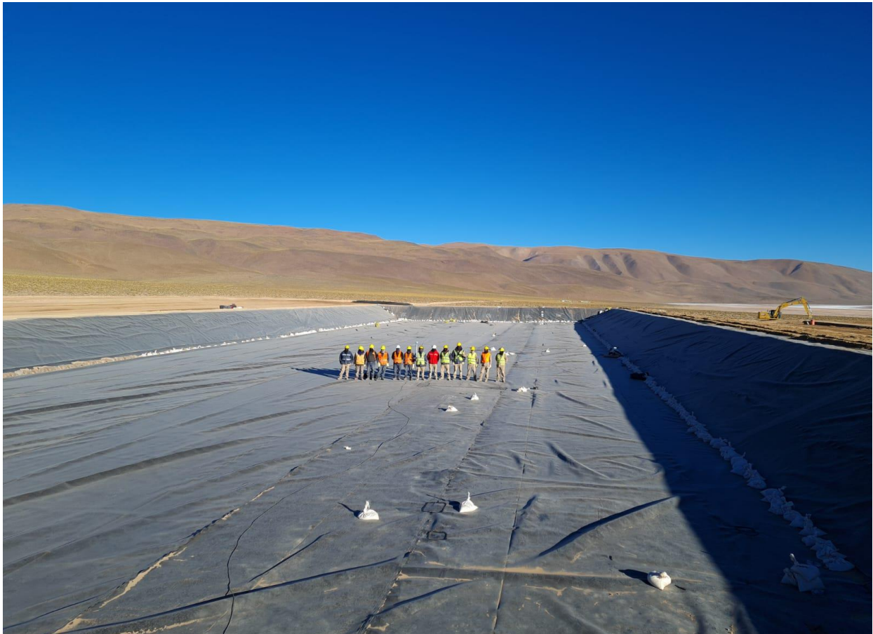
Figure 2 – Evaporation Pond S1 Ready for Filling

Commencement of brine filling sees the initiation of the evaporation testing activities of the Pilot Plant. This is a major milestone given that it marks the commencement of large-scale piloting activities at HMW.